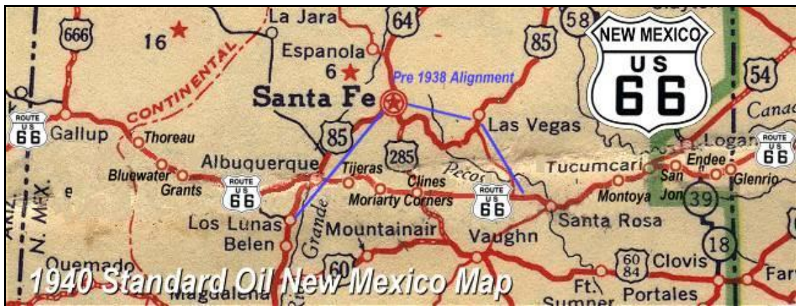
Figure 3: 1940s Road Map Showing Both Alignments of US 66

During the early years of the federal highway system, the realignment of highways was commonplace as engineers sought to create safer and more efficient roadways. Many re-alignments tended to be minor; a few involved a major re-routing of a highway. Such was the case with Route 66 as it passed through New Mexico. Approximately 507 miles long in 1926, the alignment of Route 66 in the state was reduced to 399 miles by 1937. The longest sections of the initial alignment created a large S curve as the road stretched across the middle of the state. West of Santa Rosa it turned north, crossing nearly 20 miles of empty rolling plains before crossing the Pecos River near the 19 th century Hispanic communities around Anton Chico (see Figure 3).