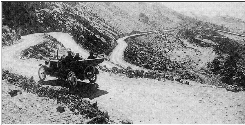
Figure 4: Car Descending 1920s Alignment of Route 66 at La Bajada

Santa Fe along Galisteo Street and turned south upon connecting with Cerrillos Street. Climbing the gentle north slope of La Bajada Mesa, the highway descended the mesa's sharp south escarpment along a series of hairpin turns before arriving at the village of La Bajada (see Figure 4). Once again aligning with the railroad just north of Domingo Station, Route 66 roughly paralleled the tracks to the east as it meandered through the alluvial fans of the Sandia Mountains before arriving at Bernalillo. There it closely paralleled the railroad, and entered Albuquerque along Fourth Street. From this point the highway crossed the Rio Grande three times; first at the Barelvas Bridge, then at Isleta Pueblo, and ultimately at Los Lunas. Heading west, Route 66 paralleled the railroad as it climbed the western escarpment of the Rio Grande Valley and curved northwest toward Correo and Laguna Pueblo. There it resumed its westward course more or less along the 35 th Parallel, crossing the Continental Divide and then paralleling the railroad as it descended the valley of the Puerco River (Rio Puerco of the West) toward Gallup and the Arizona border.