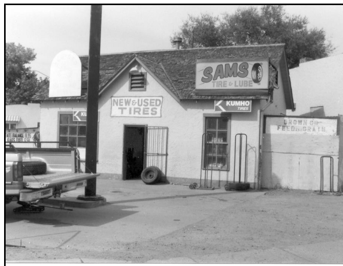
Figure 5: Otero's 66 Service, Los Lunas

In contrast, urban road sections traversed by Route 66, such as College, Water and Galisteo streets in Santa Fe and Fourth Street and Isleta Boulevard in Albuquerque, were paved during their period of service to the highway. Over the more than six decades since Route 66 was realigned to other roadways, these streets have remained largely unaltered, their current surfaces and curbing indicative of standard improvements characteristic of all urban streets. While their commercial roadsides have undergone substantial development, some of the buildings lining these streets and associated with automobile tourism prior to 1937 remain. In Santa Fe, the building histories included on the HBI forms completed as a part of the city's downtown building inventory indicate that all of the remaining buildings associated with automobile tourism have undergone substantial alterations. In Albuquerque, three early tourist courts, two gas stations and a café remain. The gas stations and café are listed as contributing resources within the Barelás-South Fourth Street Historic District. Additionally, the "Mushroom Kiosk" on Isleta Boulevard is listed in the State Register of Cultural Properties.